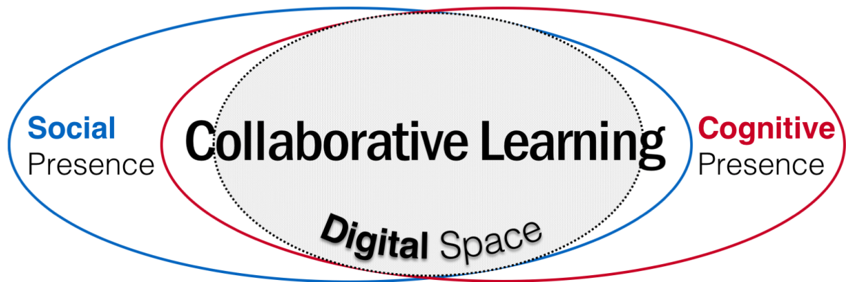
Figure 1: The Fully Online Learning Community Model (EILAB, 2022)

Community Model highlights the importance of social and cognitive presence, and promotes the critical role of instructors and students in co-creating digital collaborative learning spaces.