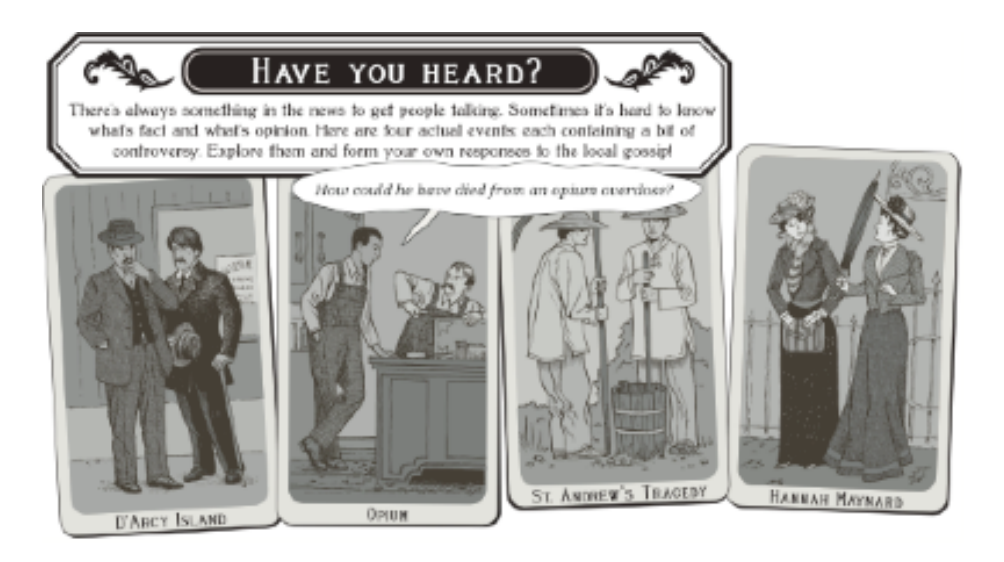
Figure 4: Part of the introductory page to the events.

gossip. The learner, being a member of society, is invited to form a personal opinion of the gossip. On the page, titled "Have you heard?" navigation to each of the four events is a picture of two members of society gossiping about the event. On rollover a speech bubble appears, showing the gossip and the prompt for the issue to be considered (see figure 4). Participating in local gossip is more appealing to a sixteen-year-old than following instructions such as "consider this topic when working through the event."