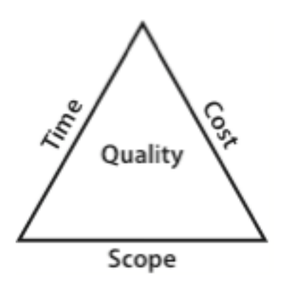
Figure 1: Project Triangle

But how does one measure the performance requirements or quality of an e-learning project? Ultimately, it is by how well the learner engages with and achieves the objectives of the project. Therefore, in managing elearning projects, the learner is the fourth constraint—measurement of requirements and quality—in the project triangle, as shown in Figure 2.