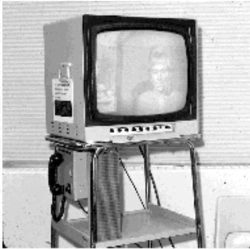
Figure 4. Television set, wheeled cart and handset

Initially, only live transmissions were used. Television cameras were transported to and from schools with the aid of a large panel truck. The truck also housed a low-power microwave transmitter and power supply. A small directional antenna mounted on the roof of the truck, beamed signals to an antenna array located on the roof of the education building tower. As the television signal from the truck traveled along “line of sight”, it was necessary to have an unobstructed path between the truck and the education building to ensure a useable signal (Personal Communication with Dr. S.M. Hunka, June 2006).