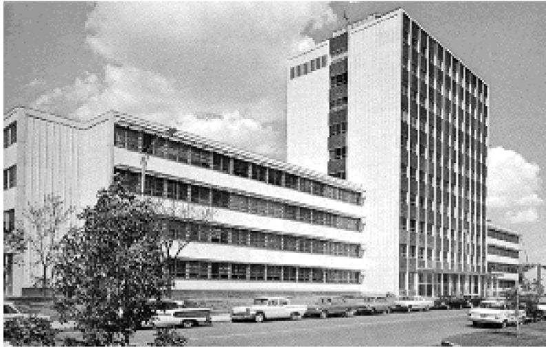
Figure 3. The education building in 1965