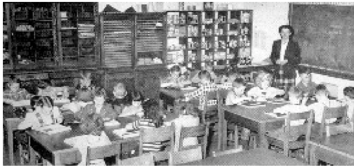
Figure 1. A classroom in the University of Alberta's demonstration school