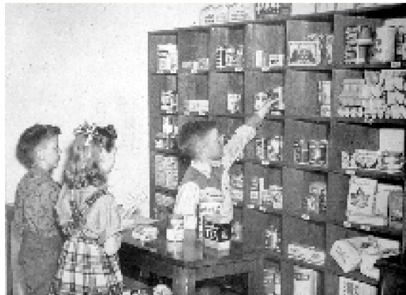
Figure 2. Classroom adapted to serve as a mock store