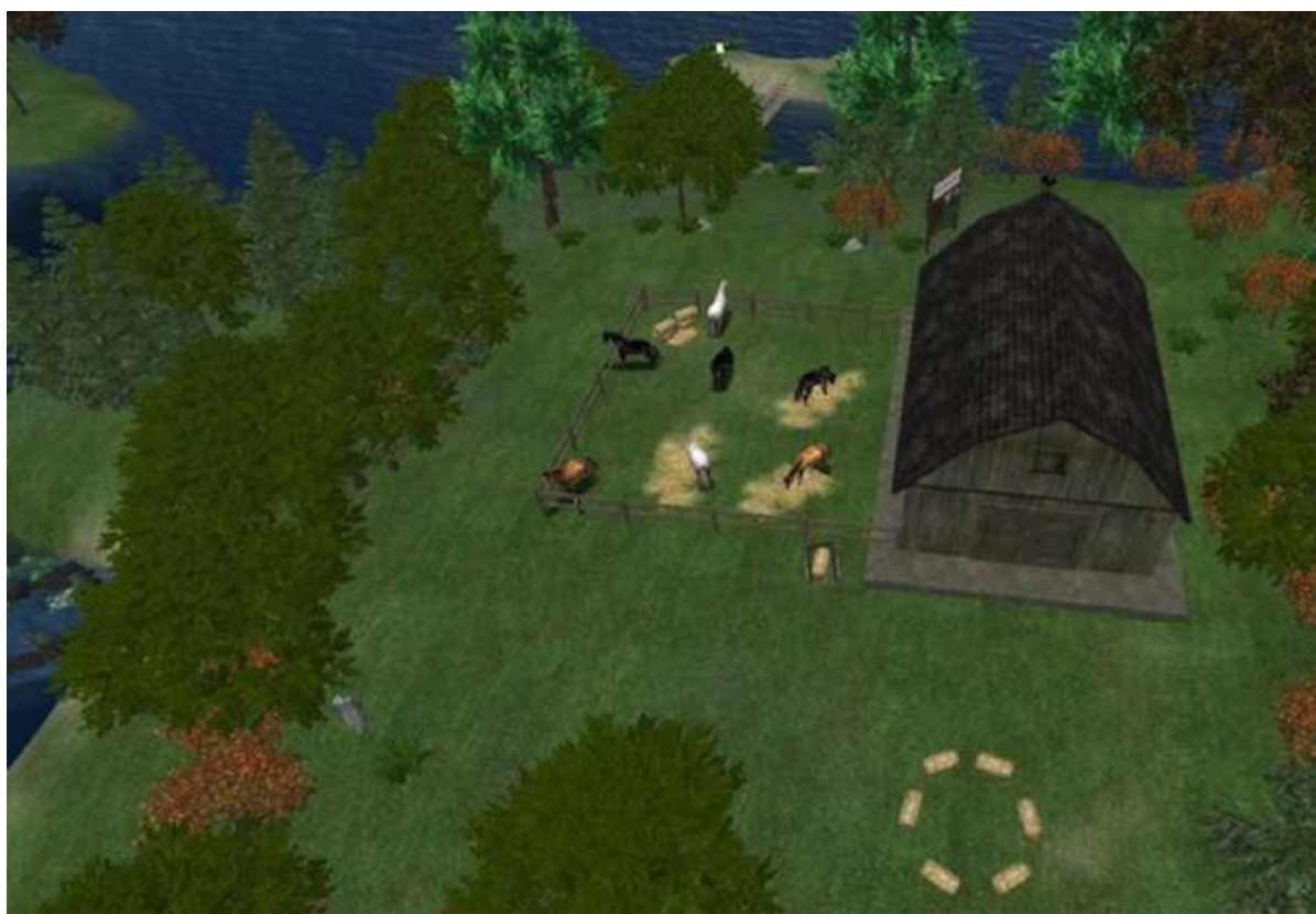
Figure 1: Easter Bush Farm in Second Life