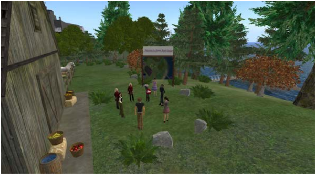
Figure 2: The “meeting place” on Easter Bush Farm in Second Life